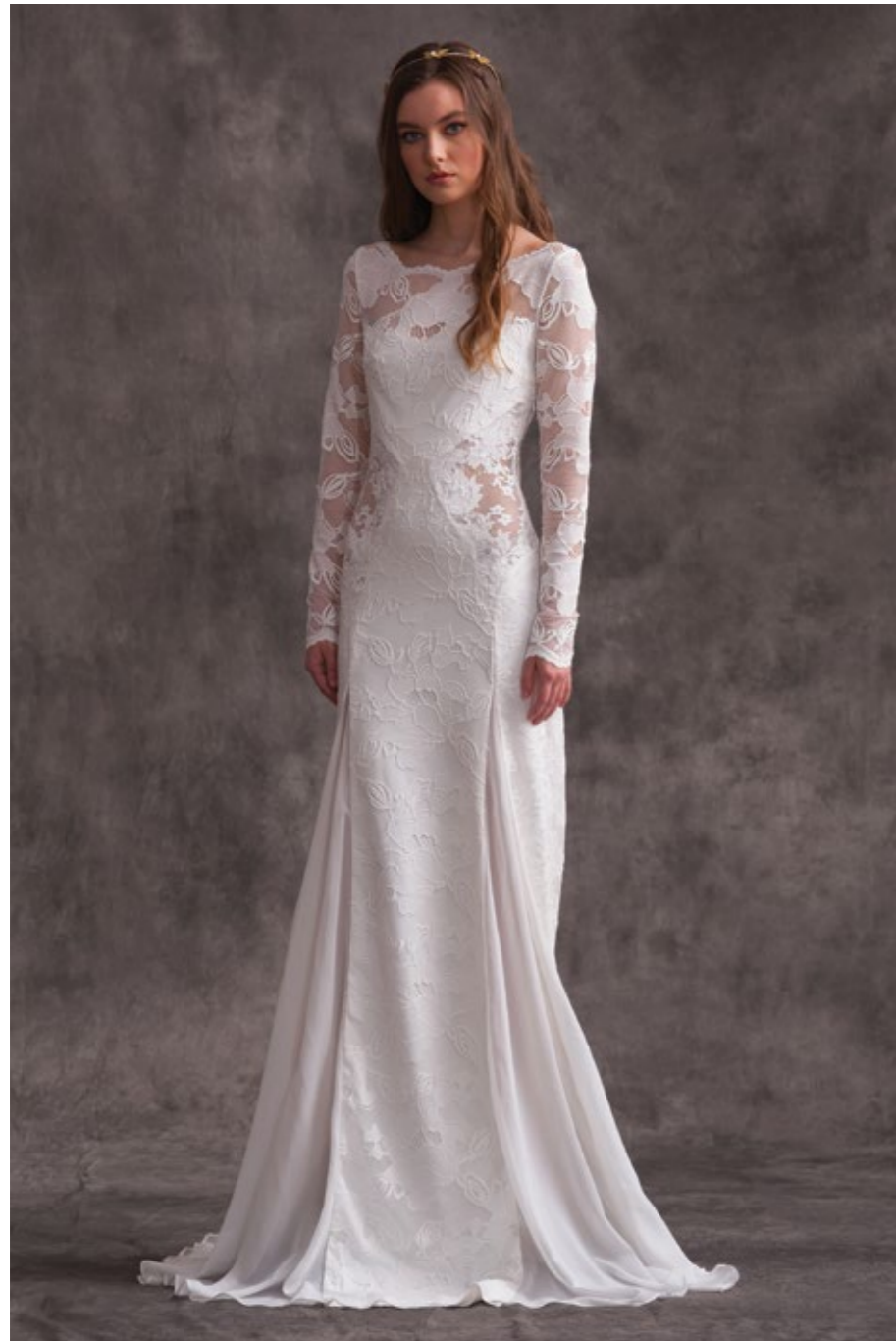
Style: 4916 Sample color: Ivory Only available as sample