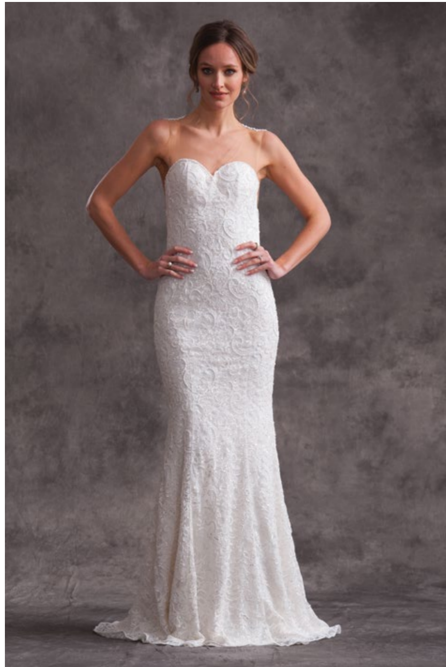
Style: OY9379 Olga Yermoloff - Haute Couture Sample color: Ivory Only available as sample