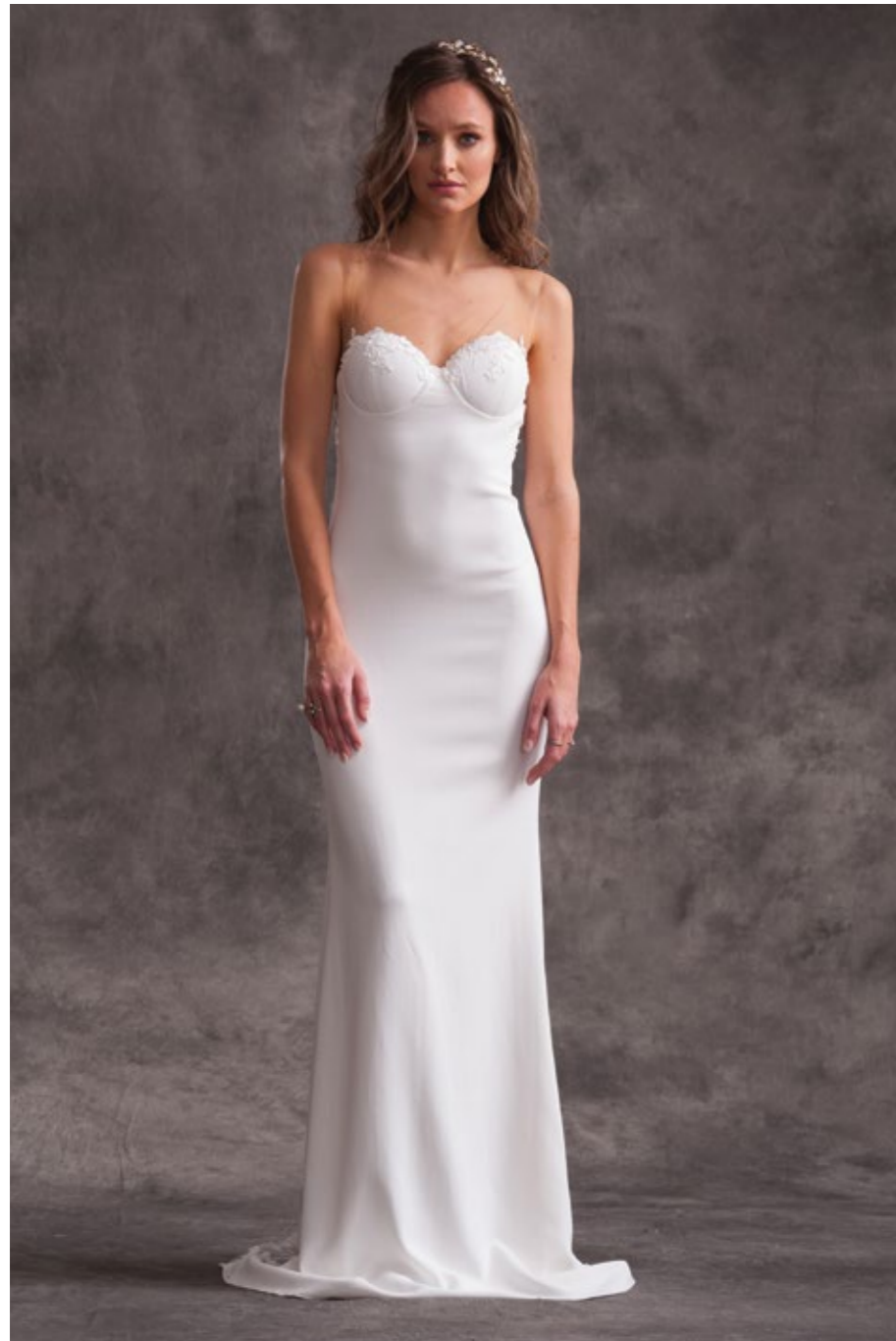
Style: 4593 Sample color: Ivory Only available as sample