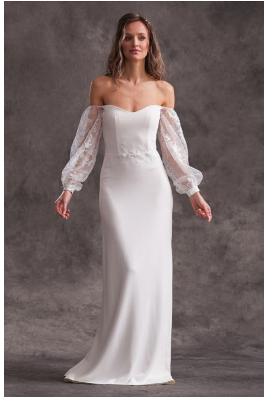
Style: 4956 Sample color: Ivory Only available as sample