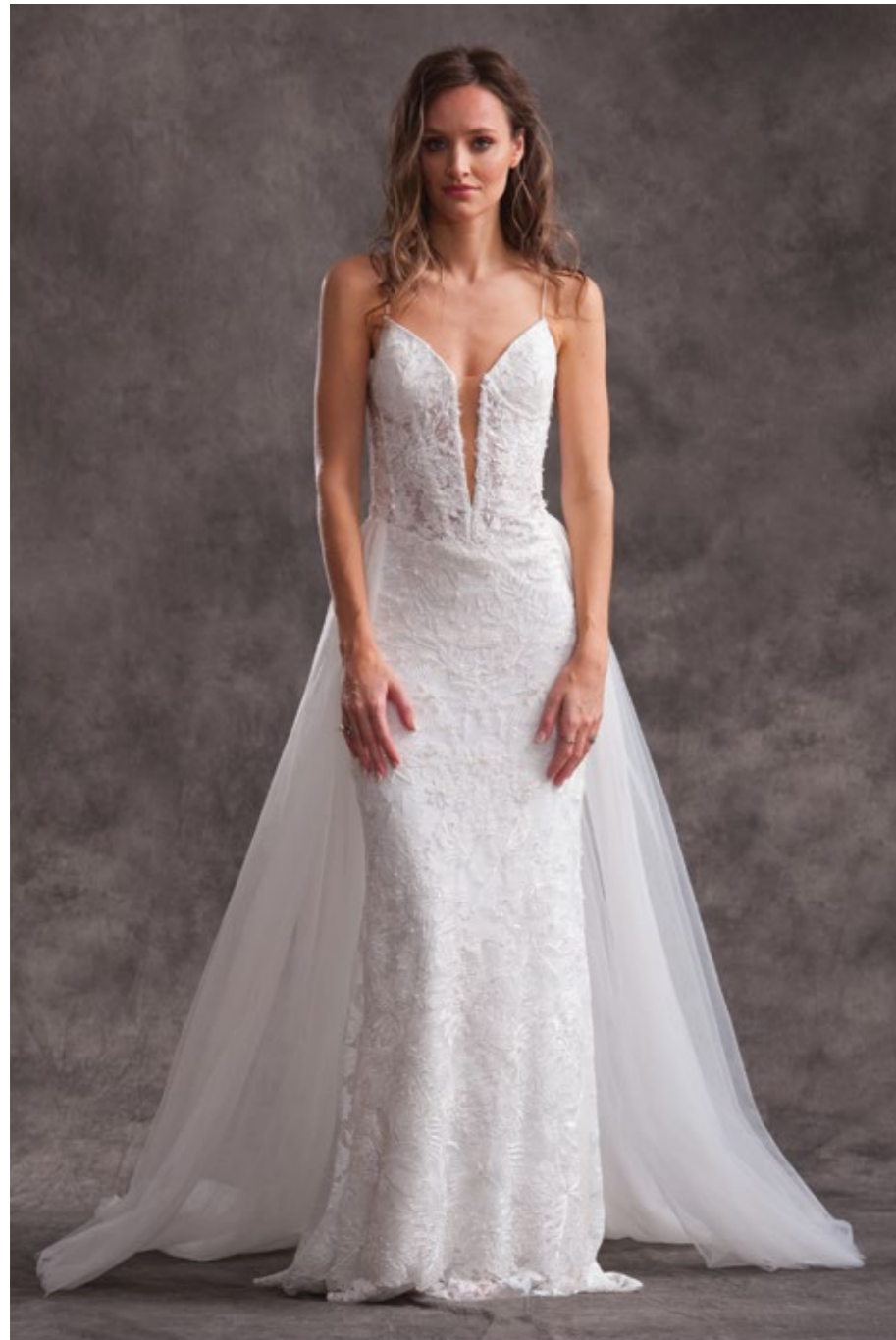
Style with detachable skirt: 4954 Sample color: Ivory Only available as sample