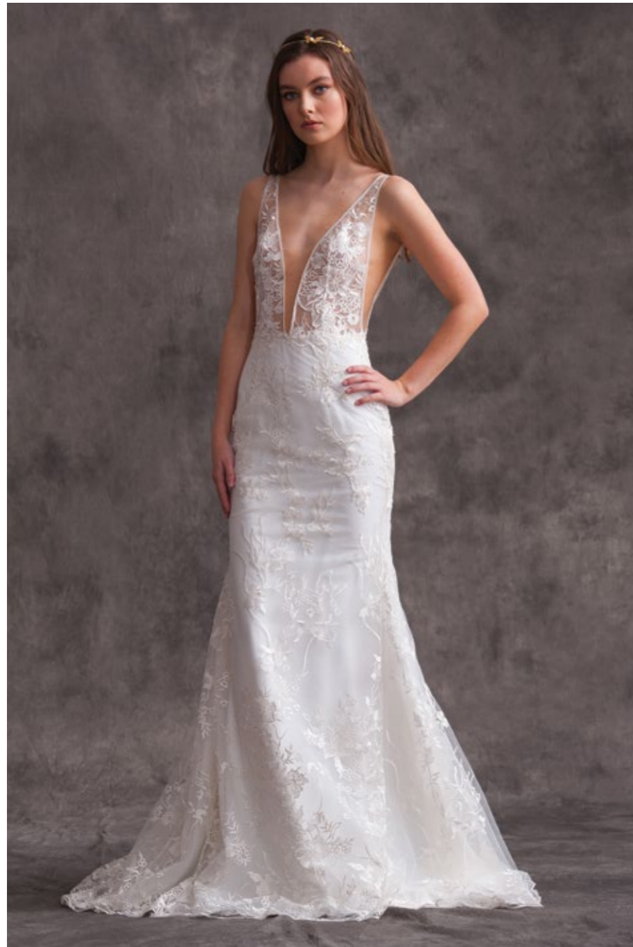
Style: 4933 Sample color: Ivory Only available as sample