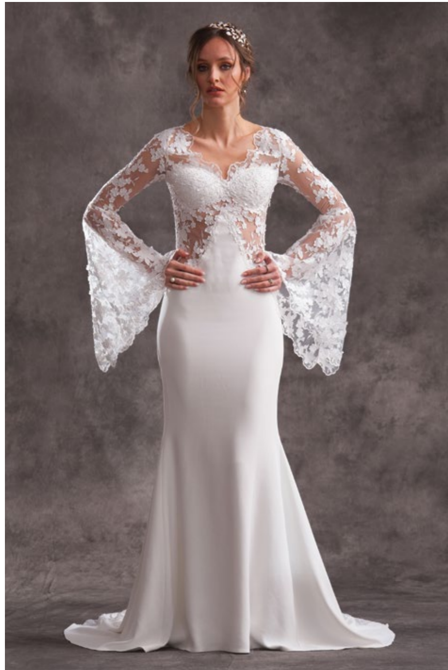
Style: OY9372 Olga Yermoloff - Haute Couture Sample color: Ivory Only available as sample