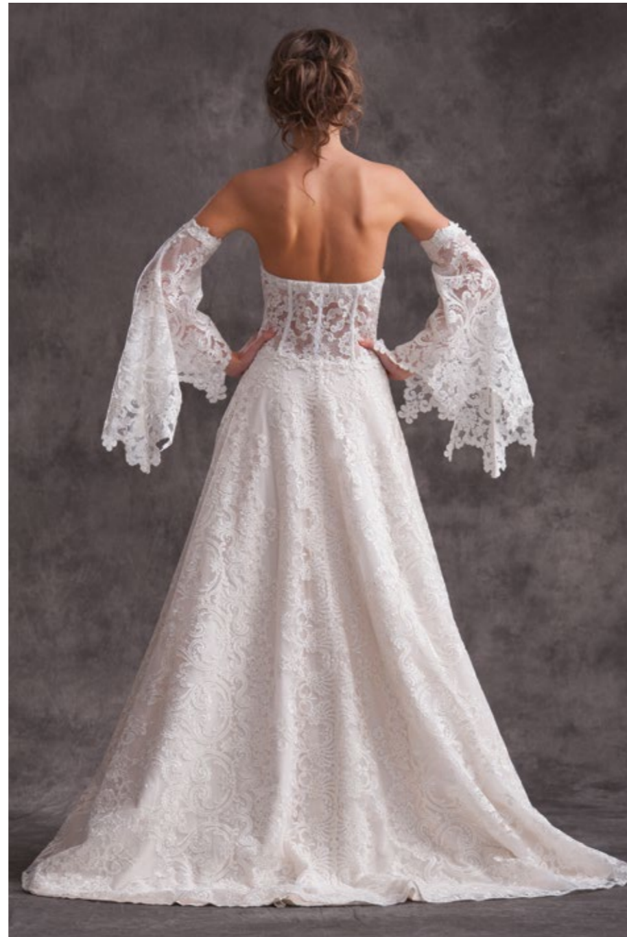
Style with detachable sleeves: 4963 Sample color: Ivory Only available as sample