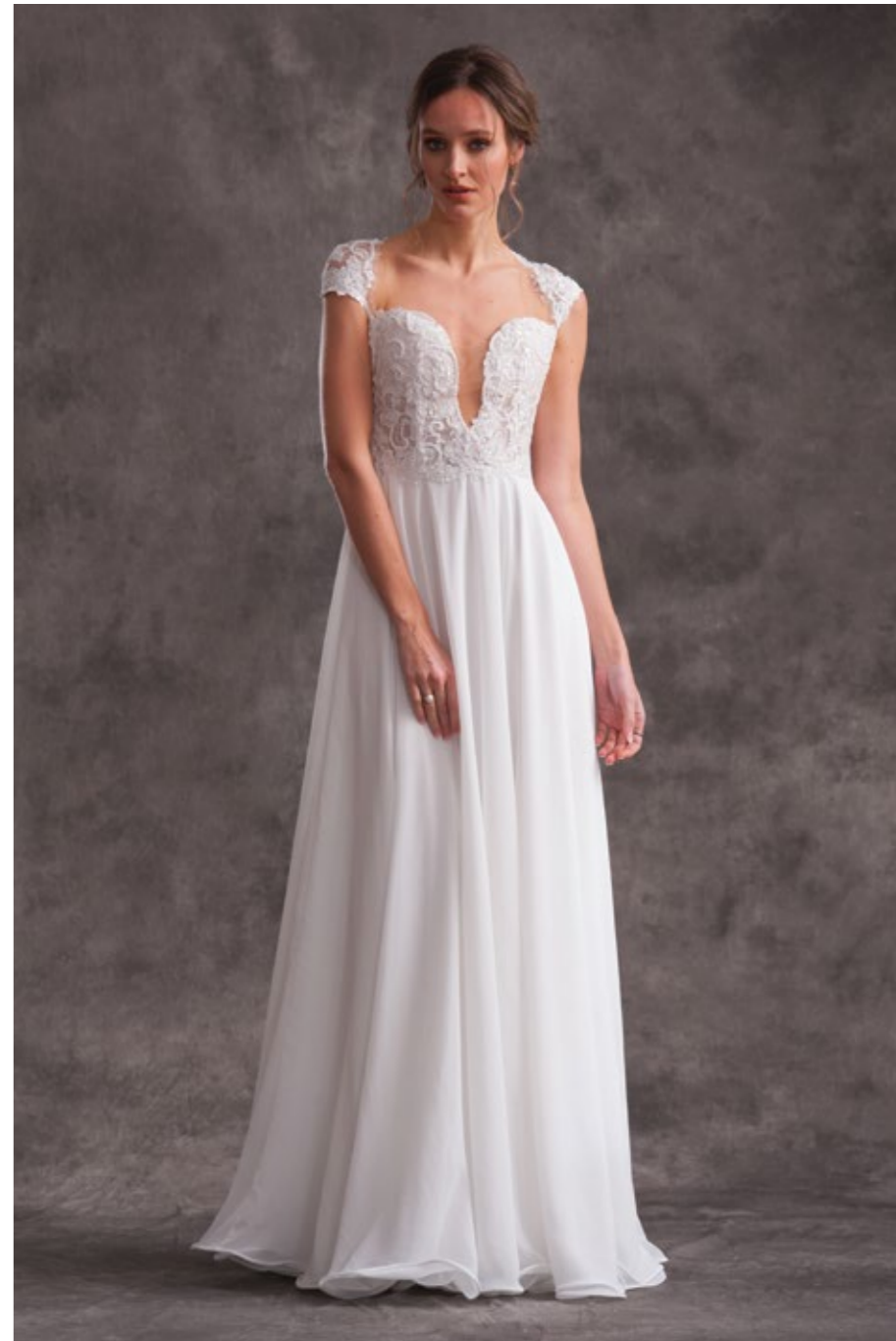
Style: OY9373 Olga Yermoloff - Haute Couture Sample color: Ivory Only available as sample