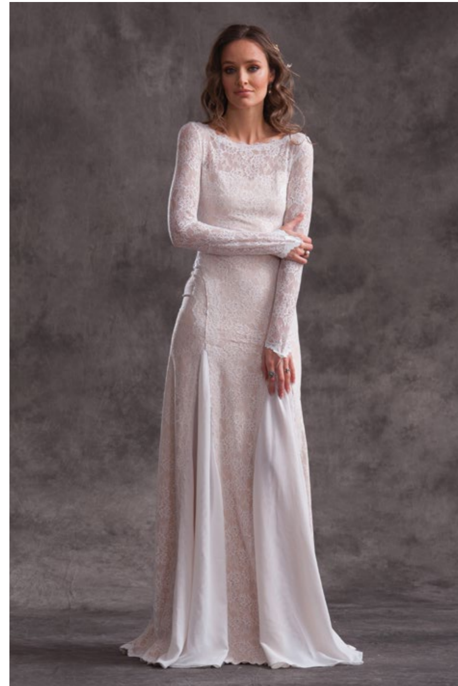
Style: 4917 Sample color: Ivory on Champagne lining Only available as sample