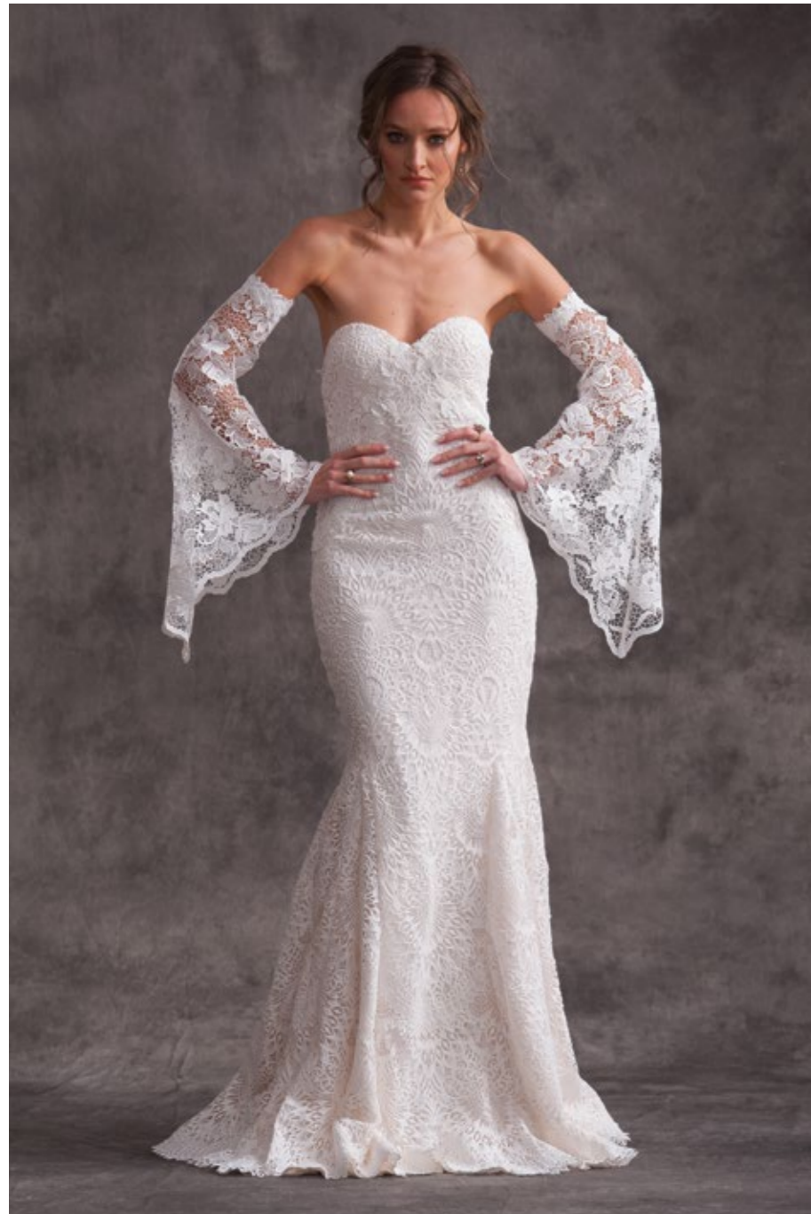
Style with detachable sleeves: 4952 Sample color: Ivory Only available as sample