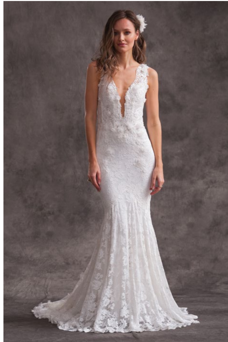
Style: 4937 Sample color: Ivory Only available as sample