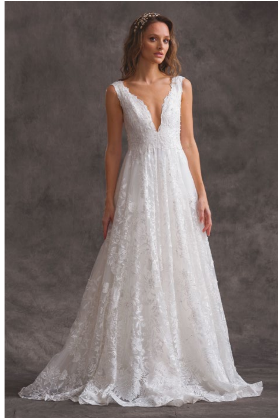
Style: 4959 Sample color: Ivory Only available as sample