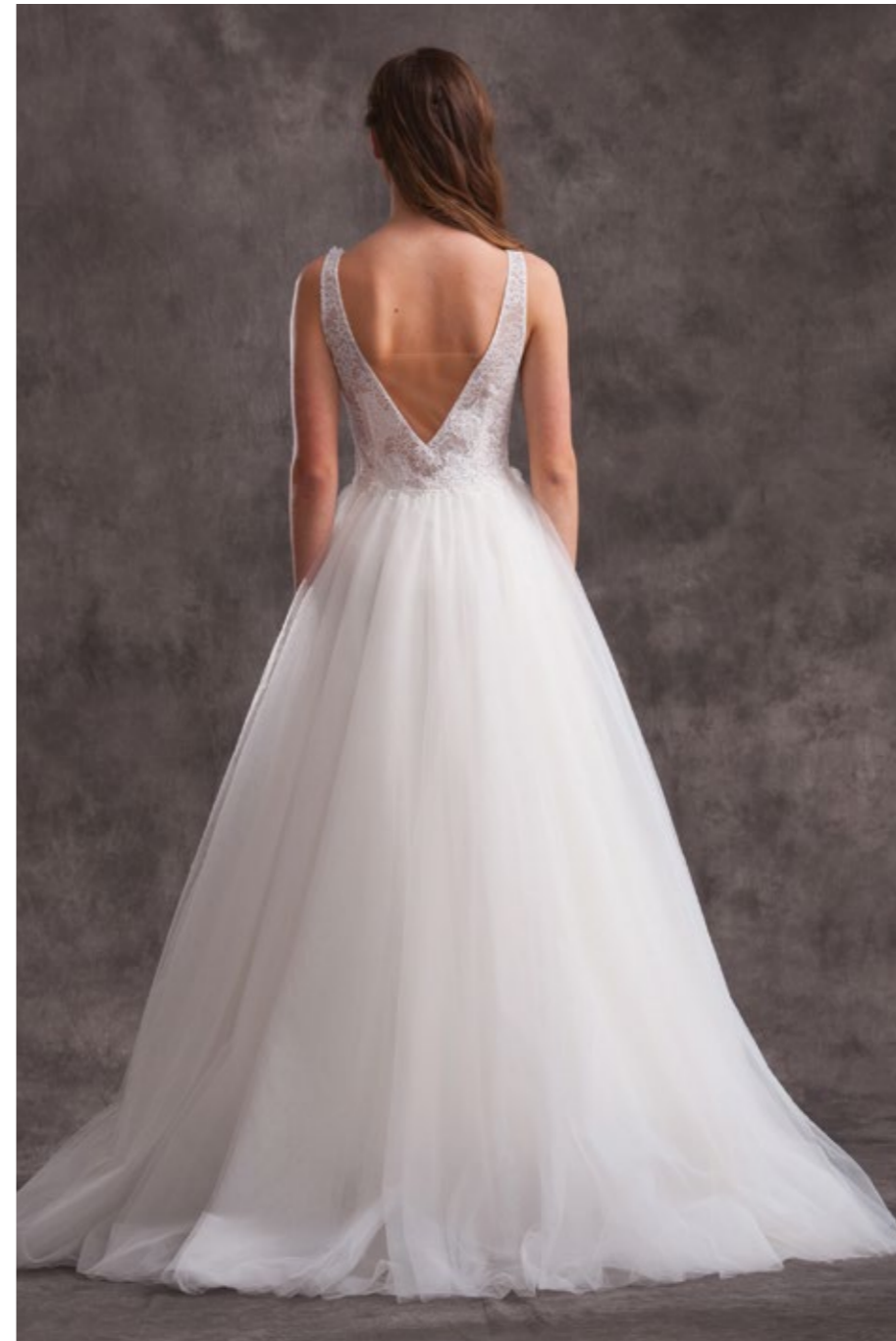
Style: 4934 Sample color: Ivory Only available as sample