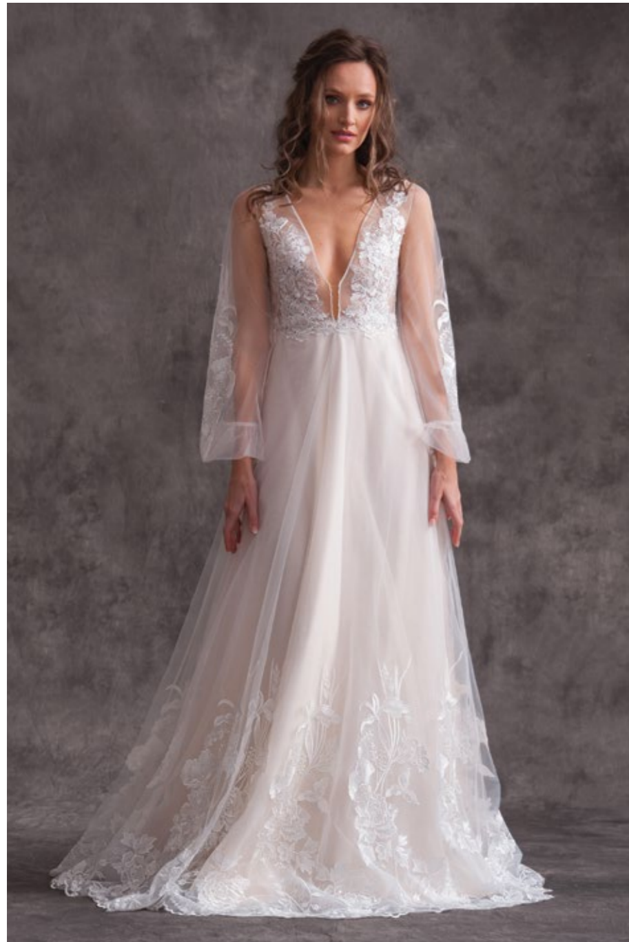
Style: 4942 Sample color: Ivory Cream Only available as sample