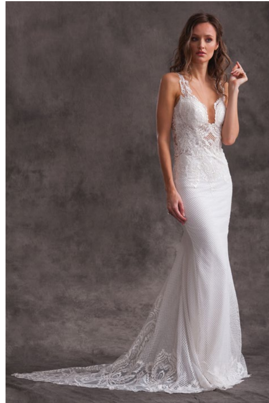
Style: 4955 Sample color: Ivory Only available as sample