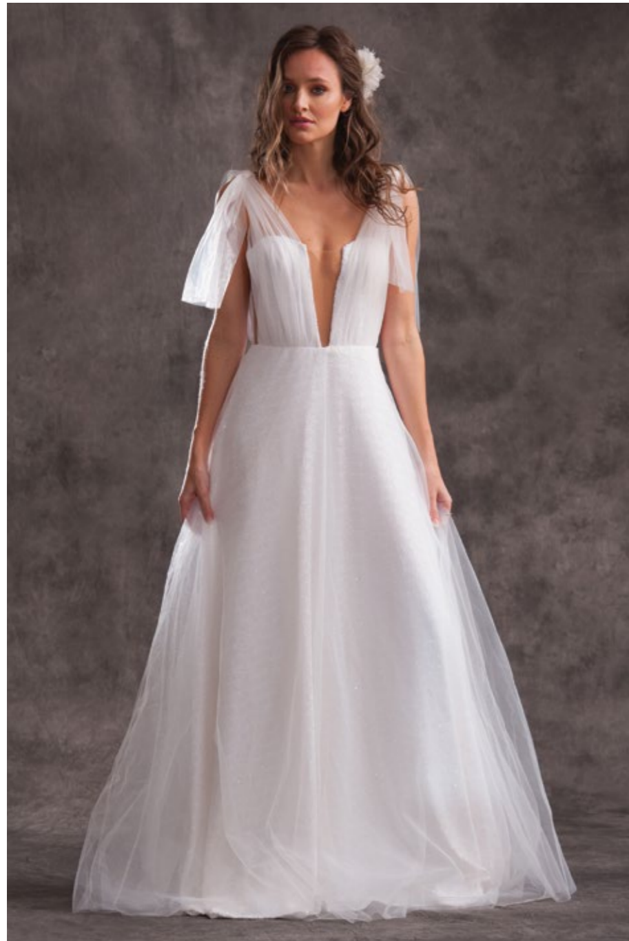
Style: 4936 Sample color: Ivory Only available as sample