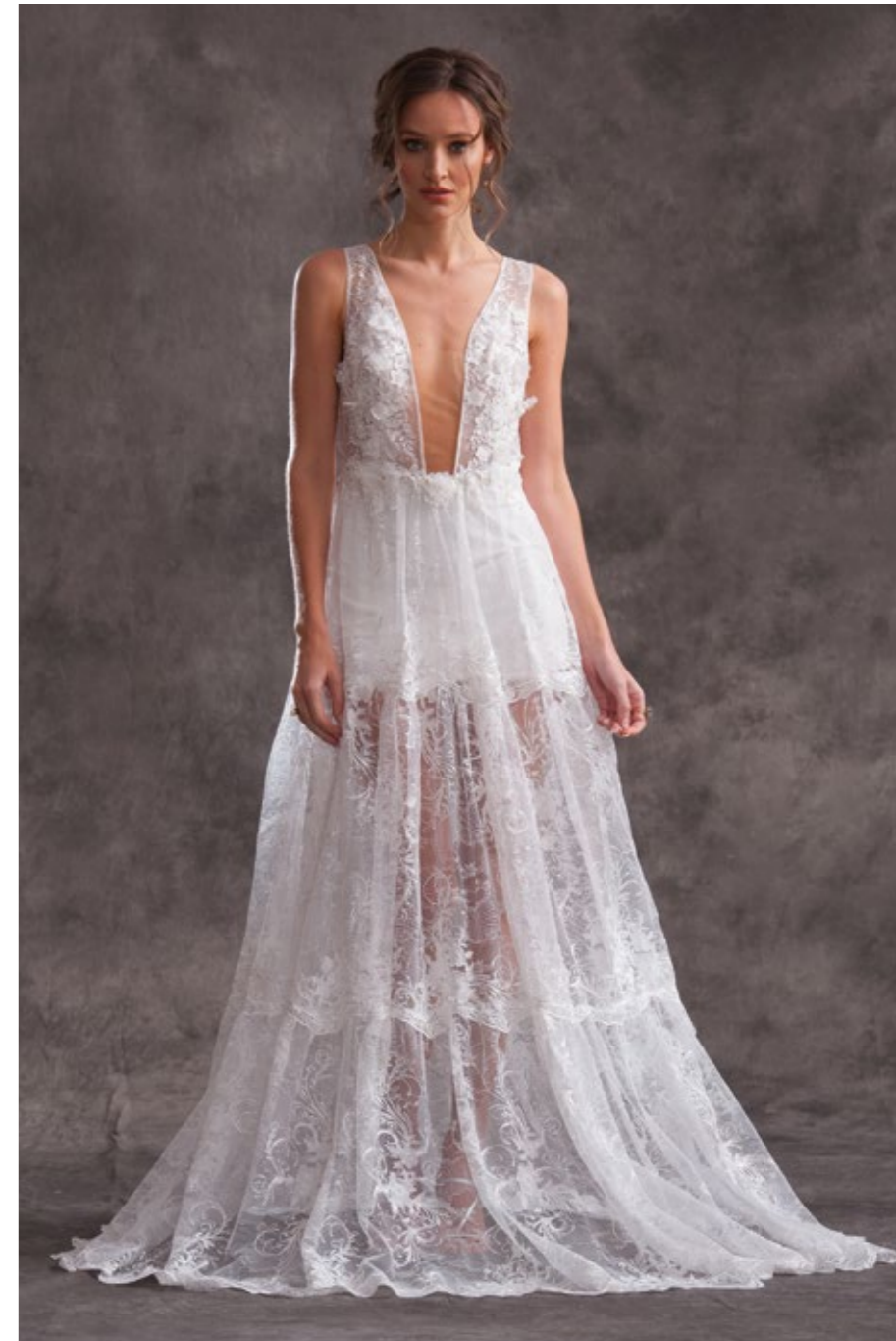
Style: 4953 Sample color: Ivory Only available as sample