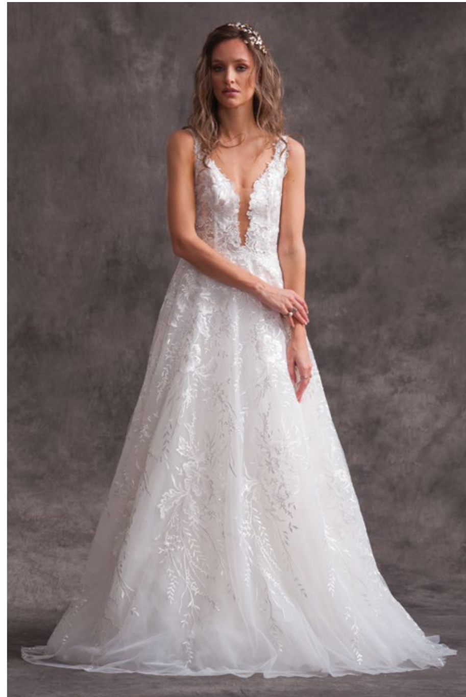
Style: 4589 Sample color: Ivory Only available as sample