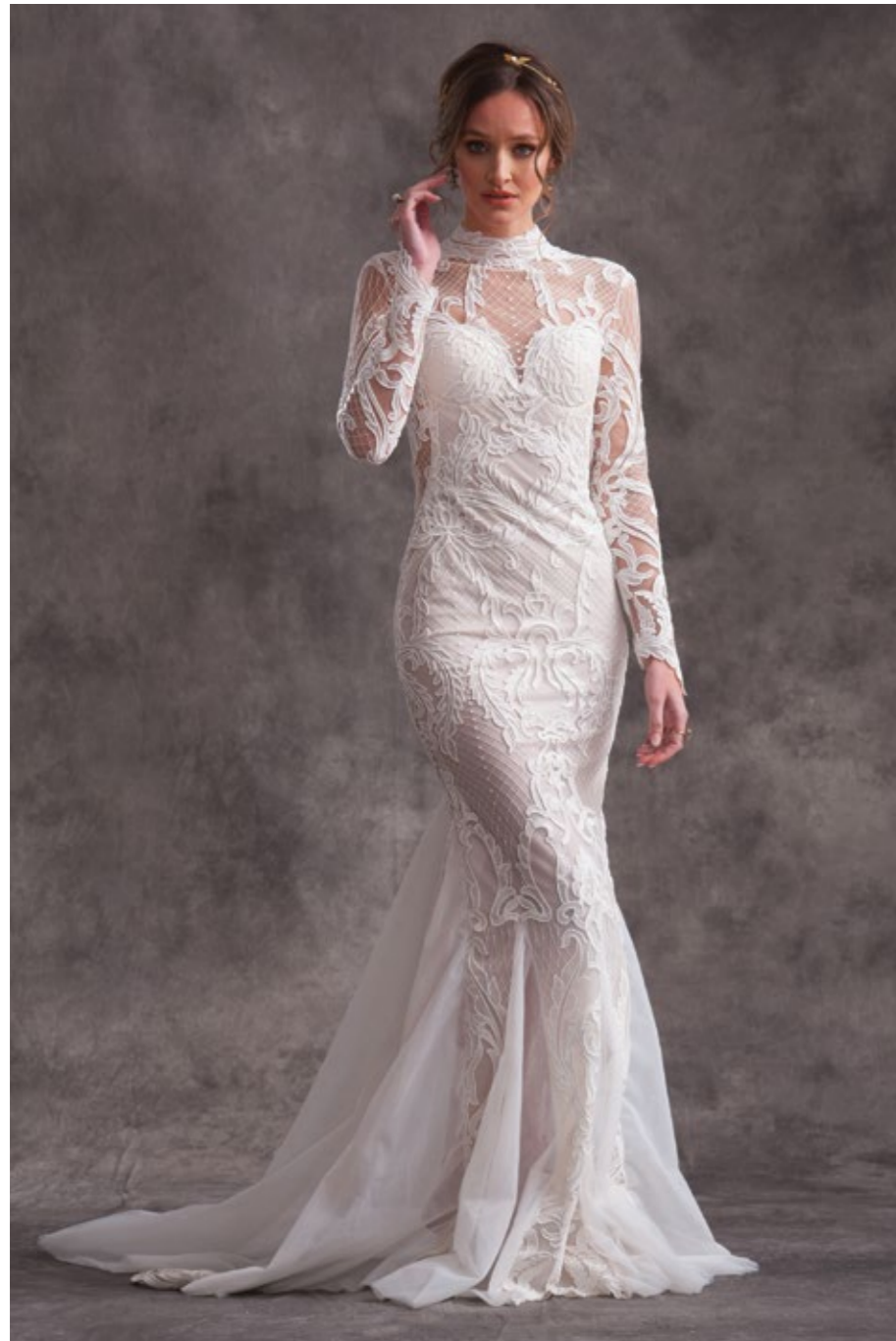
Style: 4585 Sample color: Ivory Only available as sample