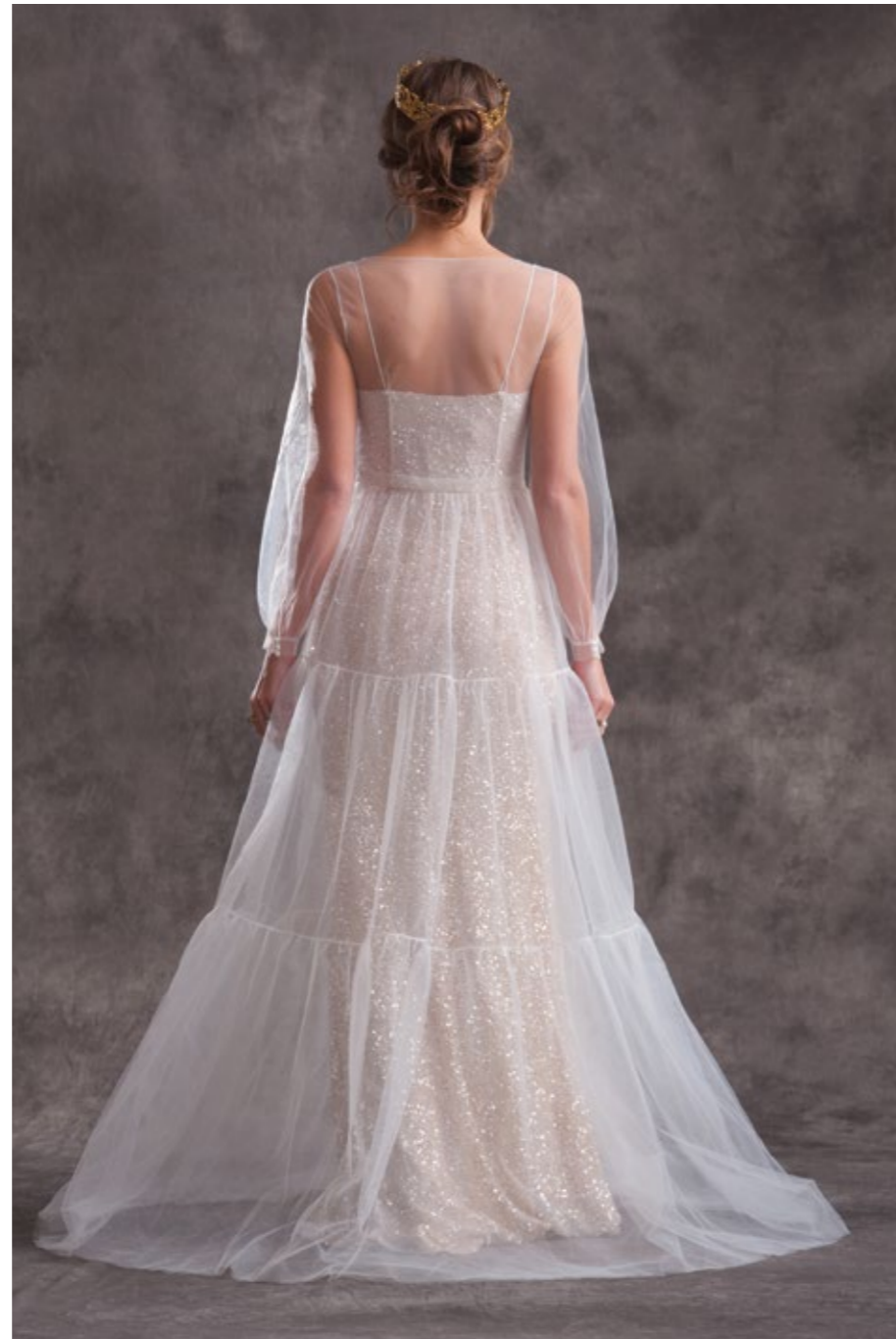
Style: OY9377 Olga Yermoloff - Haute Couture Sample color: Sunkiss Only available as sample