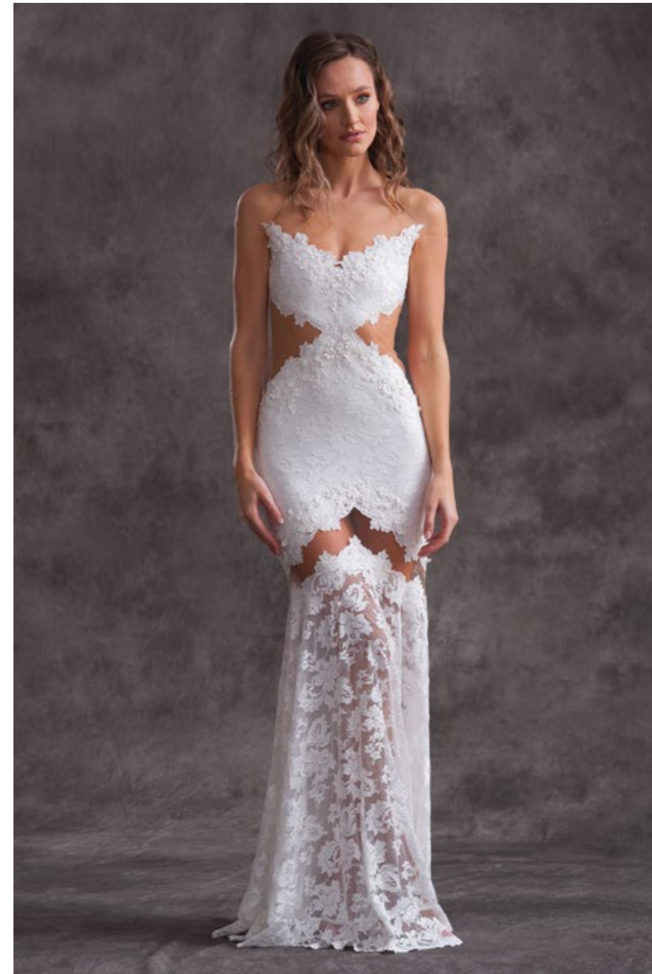
Style: 4922 Sample color: Ivory Only available as sample