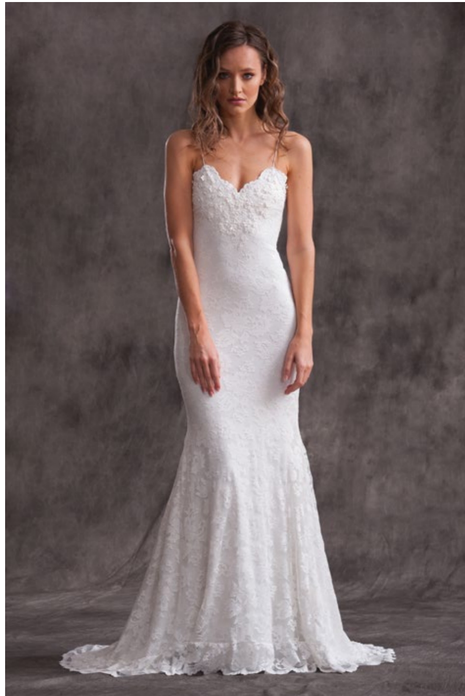
Style: 4914 Sample color: Ivory Only available as sample