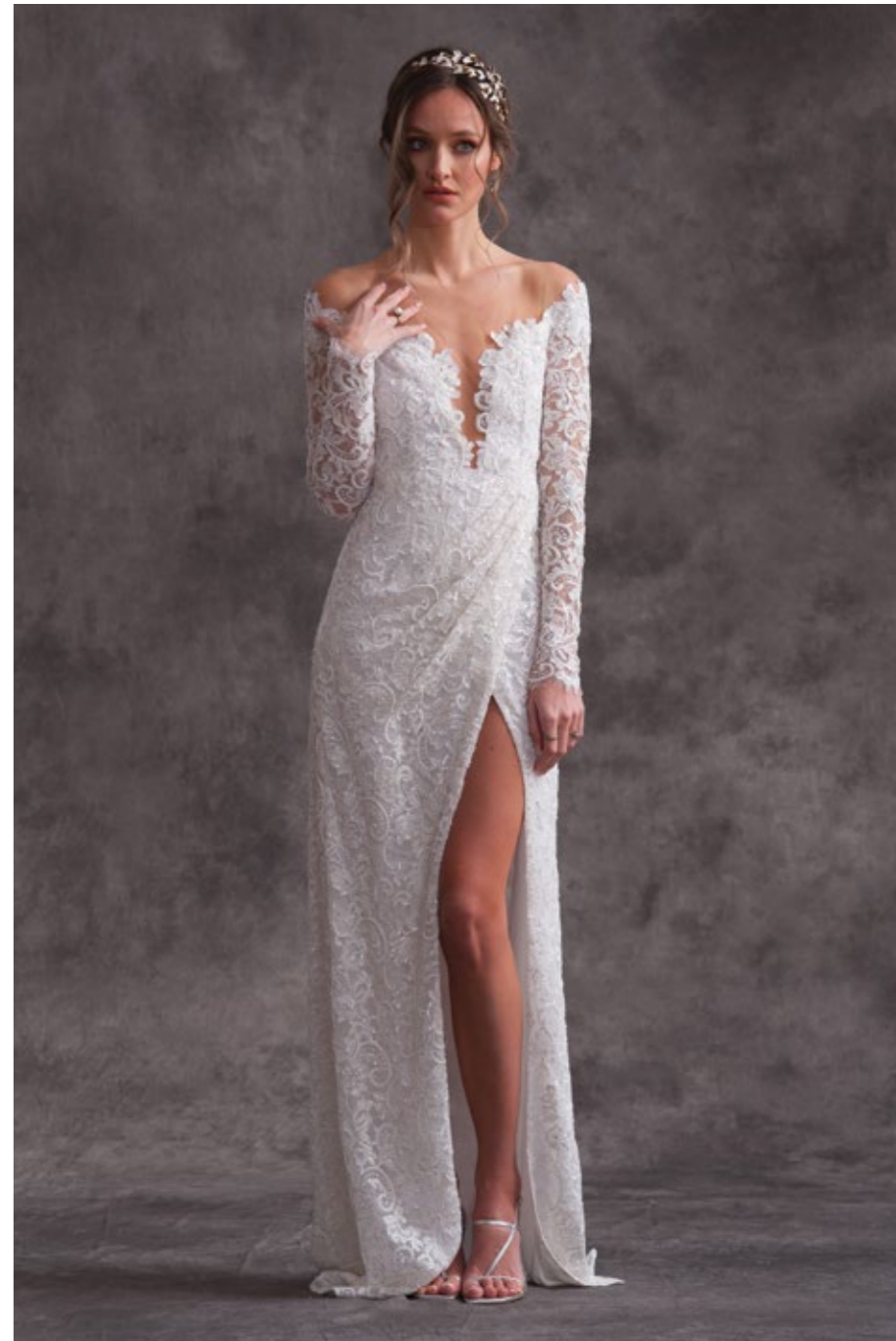
Style: OY9378 Olga Yermoloff - Haute Couture Sample color: Ivory Only available as sample