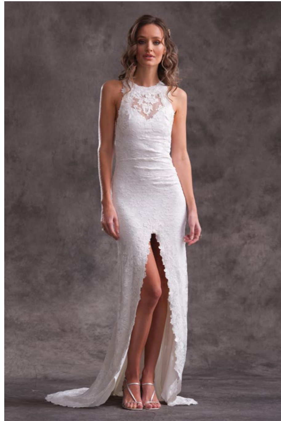
Style: 4915 Sample color: Ivory Only available as sample