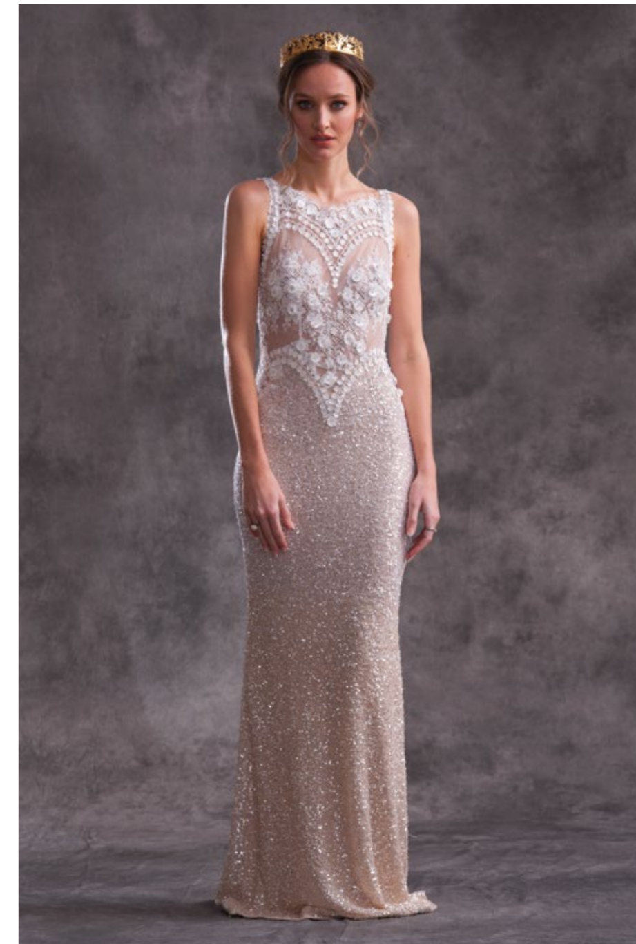
Style: OY9374 Olga Yermoloff - Haute Couture Sample color: Sunkiss Only available as sample