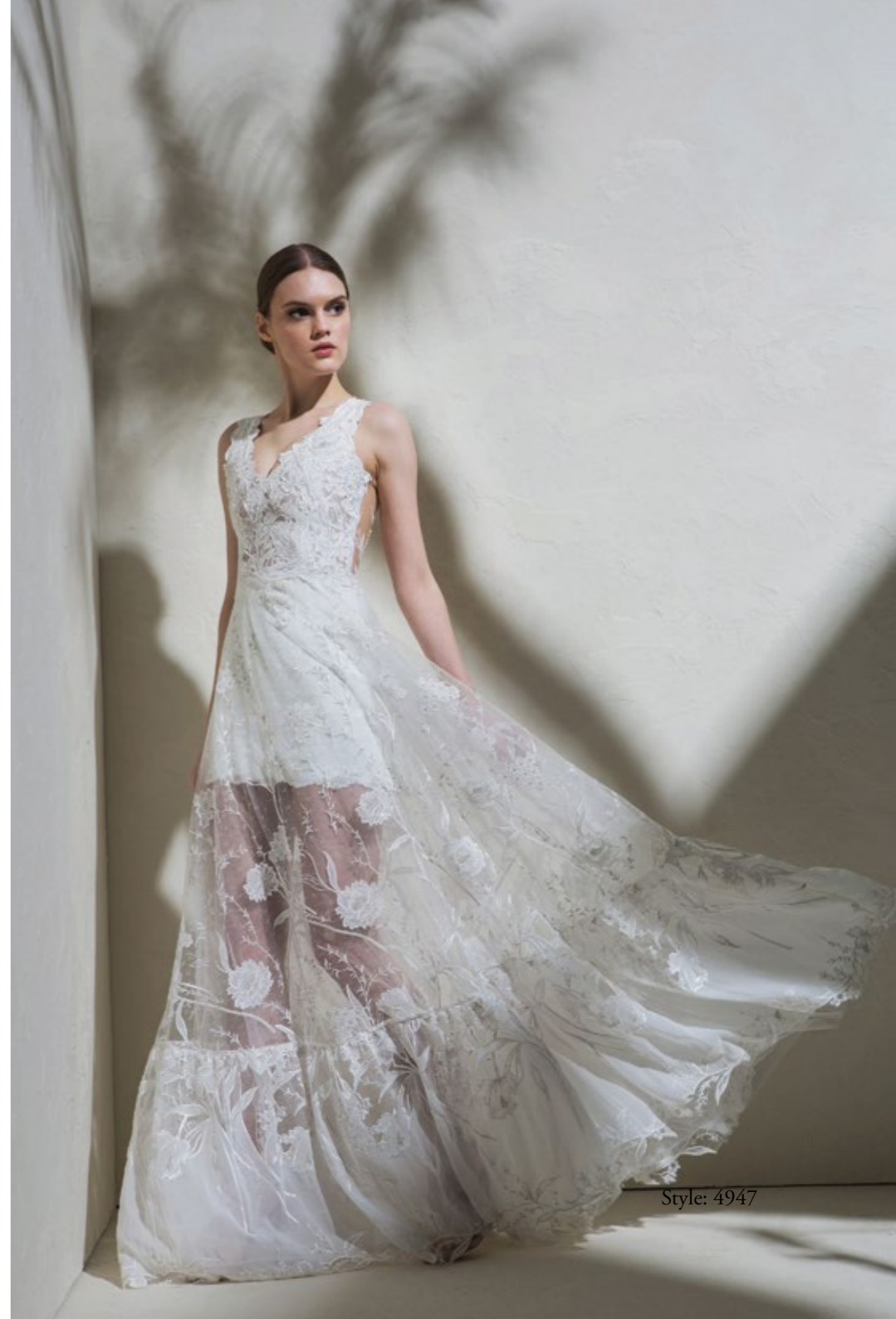
Style: 4947 Sample color: Ivory Only available as sample