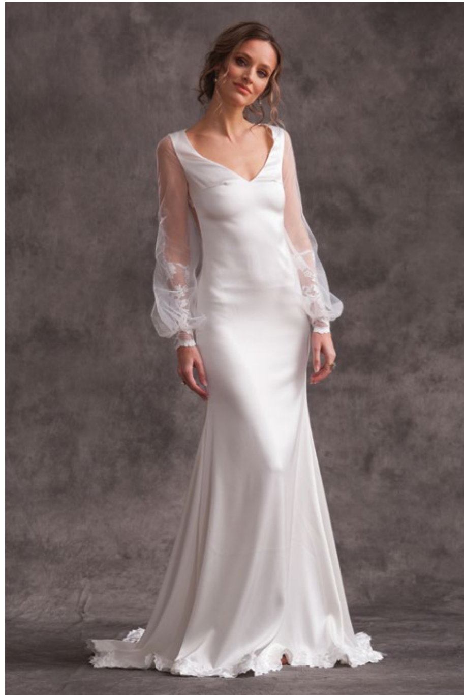
Style: 4592 Sample color: Ivory Only available as sample