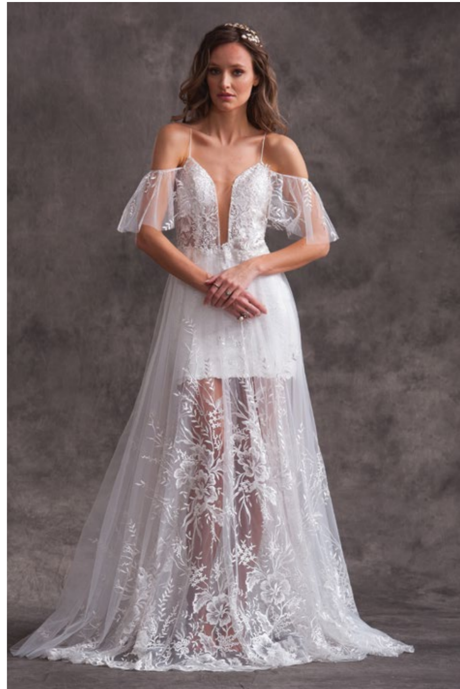
Style: 4944 Sample color: Ivory Only available as sample