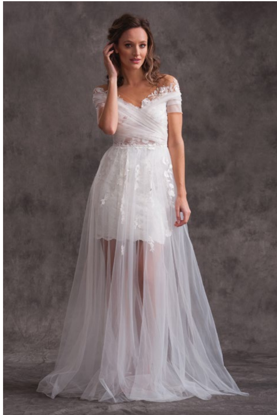
Style: 4587 Sample color: Ivory Only available as sample