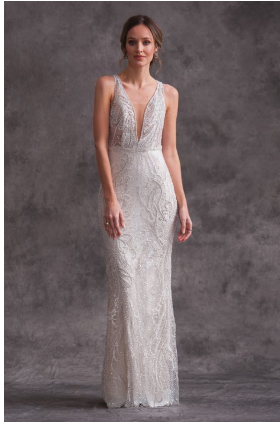
Style: OY9322 Olga Yermoloff - Haute Couture Sample color: Ivory Only available as sample