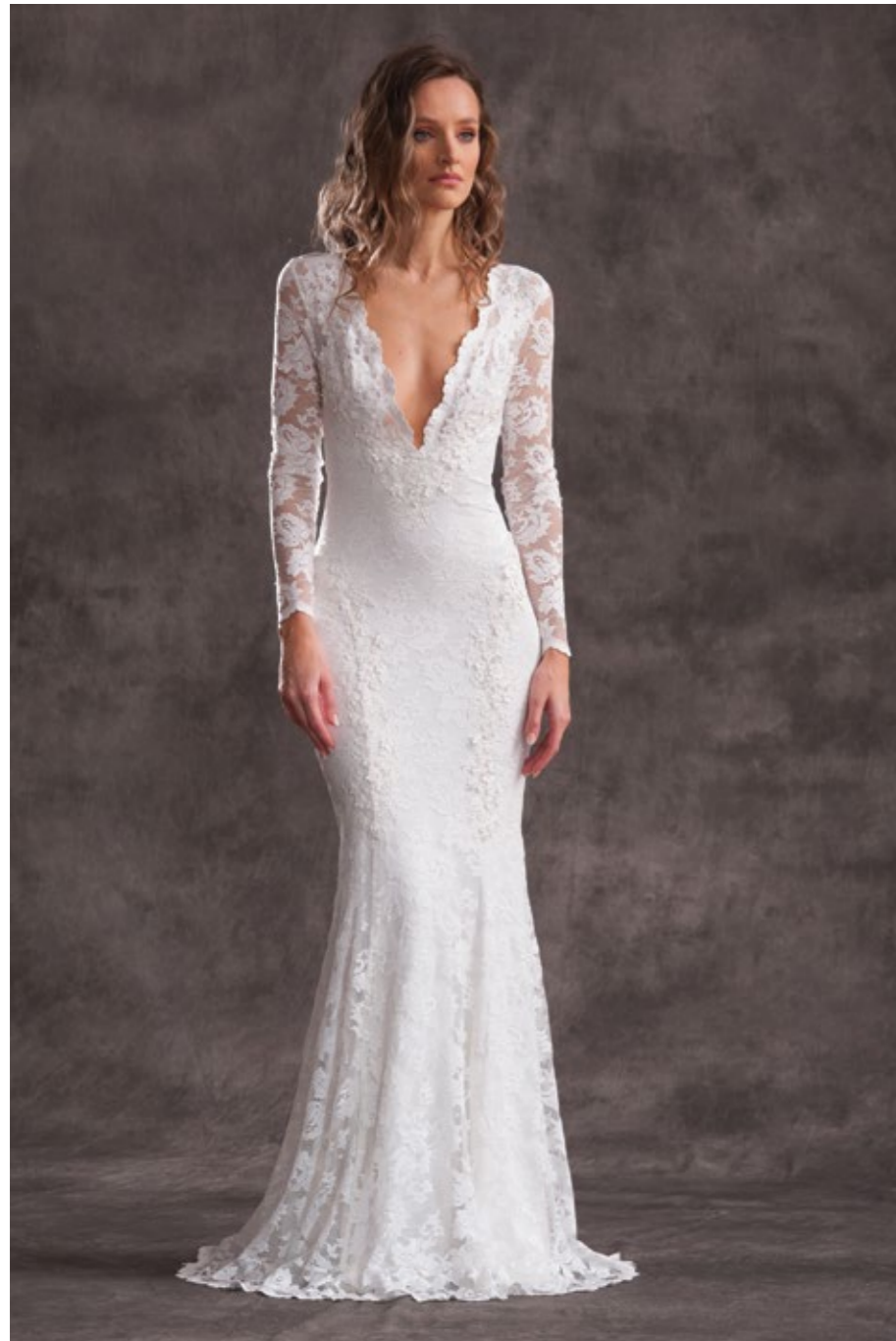
Style: 4920 Sample color: Ivory Only available as sample