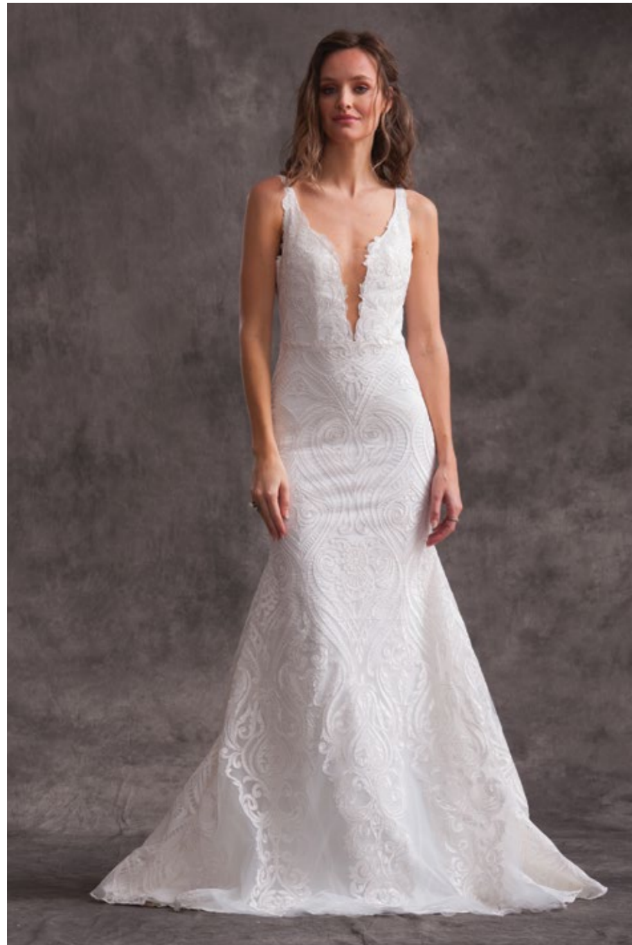
Style: 4588 Sample color: Ivory Only available as sample