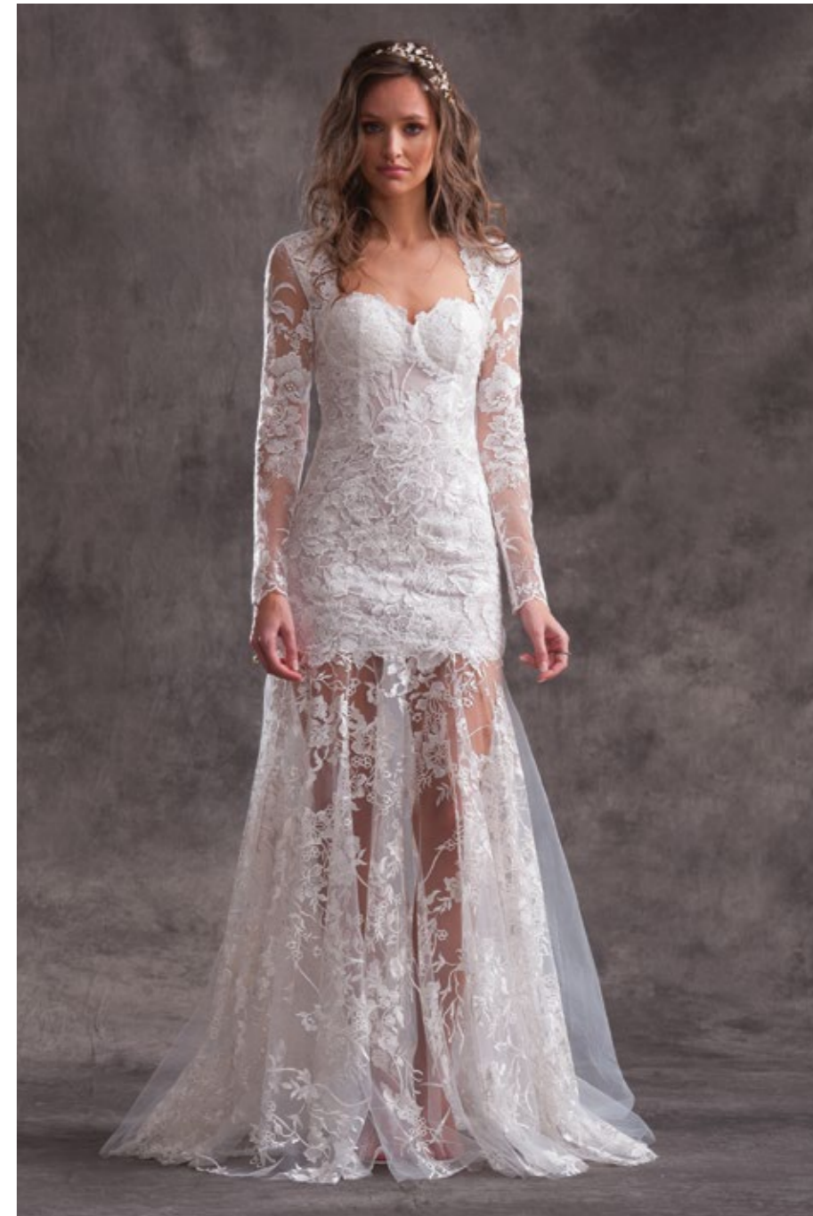
Style: 4945 Sample color: Ivory Only available as sample