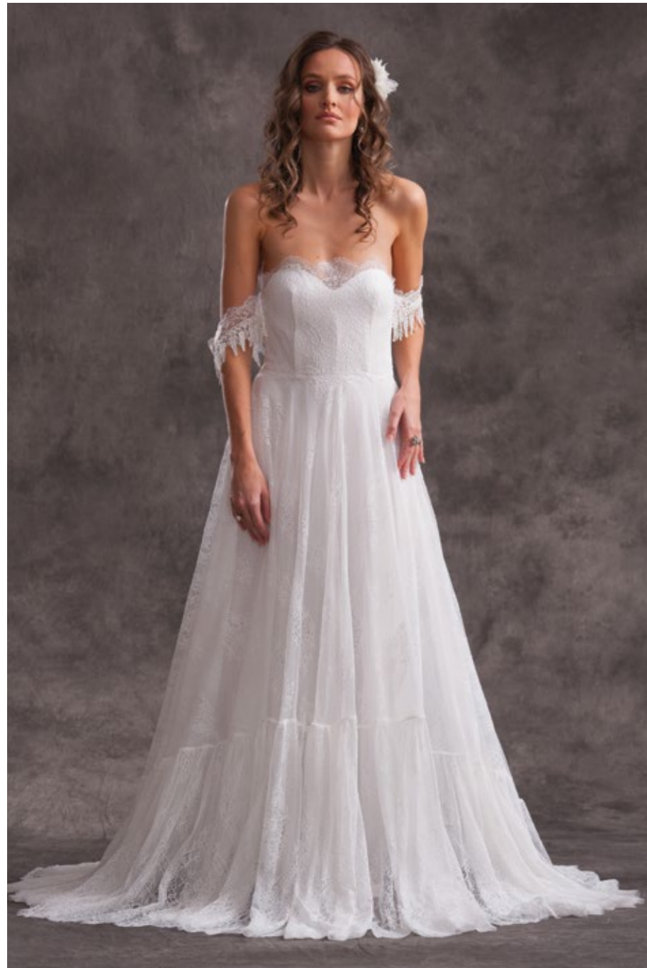
Style: 4951 Sample color: Ivory Only available as sample