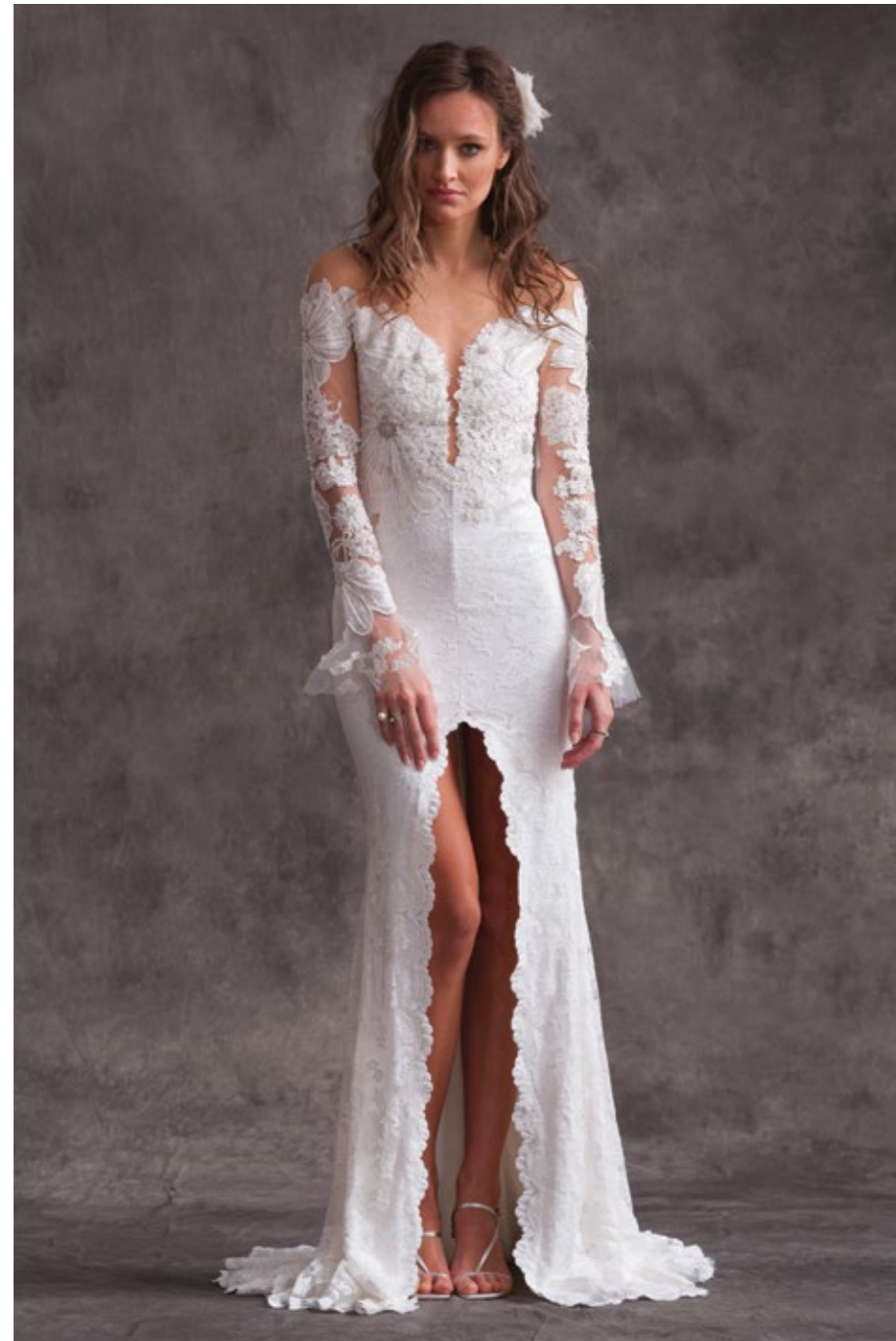
Style: 4935 Sample color: Ivory Only available as sample