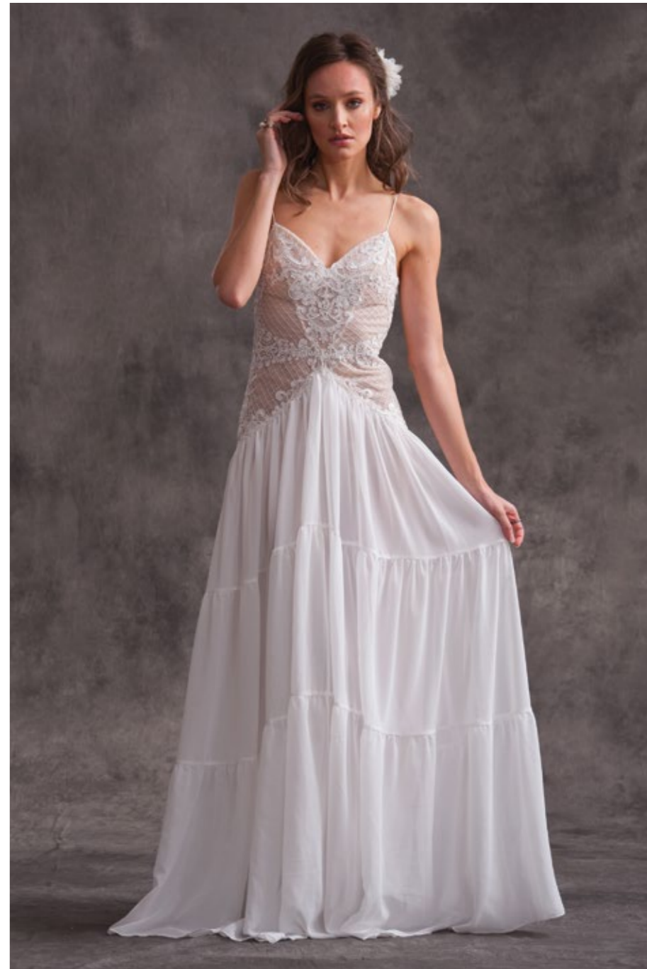
Style: 4921 Sample color: Ivory Only available as sample